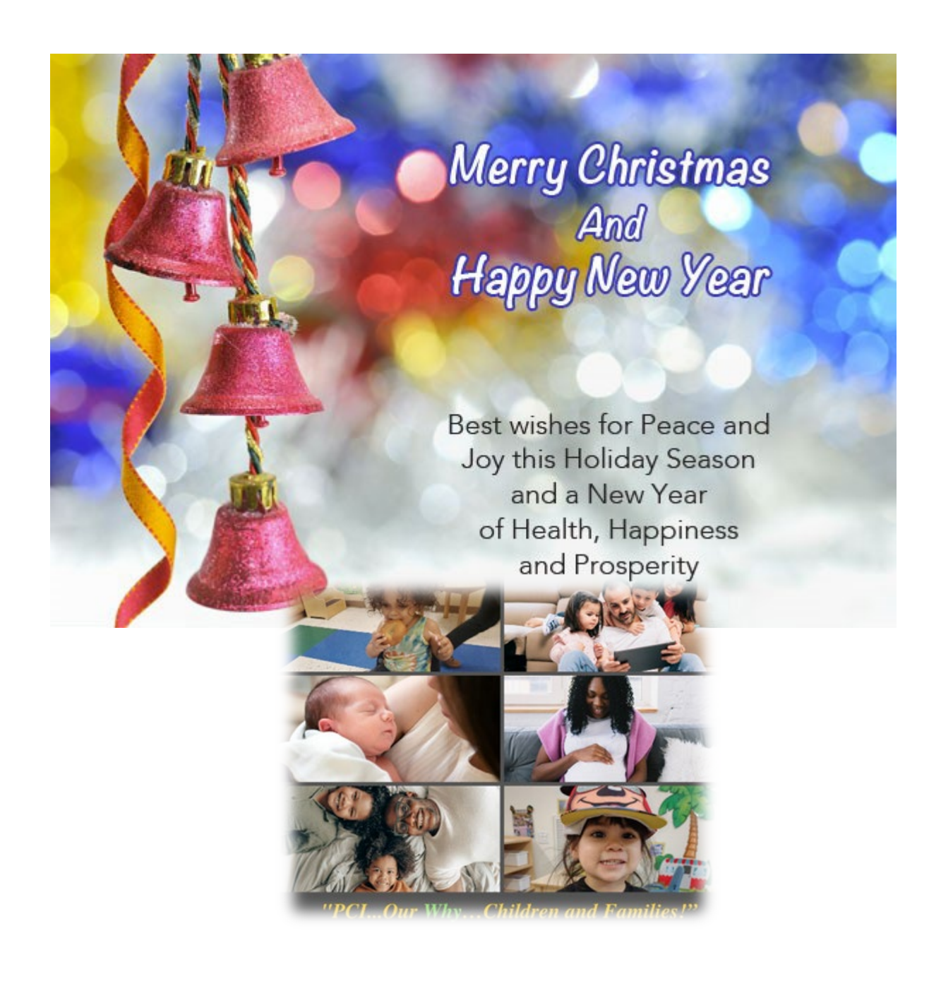
"PCI...Growing San Antonio's Tomorrow...Today!"