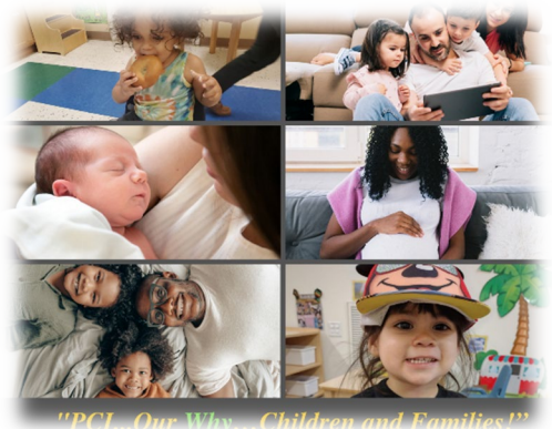
"PCI... Our Why... Children and Families!"

"Luxury is building tomorrows, living todays, and cherishing yesterdays." - Adlai Stevenson