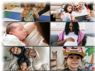
"PCI...Our Why...Children and Families!"

"PCI...Our WHY...Children and Families!"