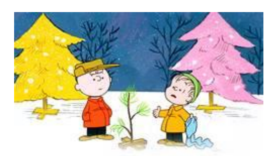
"I never thought it was such a bad little tree. It's not bad at all, really. Maybe it just needs a little love."

As always, whether in the classroom or at home, parental involvement and enthusiasm is the number one key to maintaining a positive attitude in every child's education! Beginning January, the Parents Care Initiative will begin to provide parents with an opportunity to ramp up their participation. Look forward to receiving your center's cards with your mascot when we return!