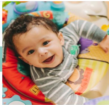
"Growing San Antonio's Tomorrow...Today!"

Parent/Child Incorporated’s Annual Report to the Public was a tremendous success! This report, required by Head Start agencies, provides transparency about the funds received, the number of children and families served, and the overall performance of the agency. It reaffirms PCI’s commitment to high-quality service and the integrity with which we serve our children and families.